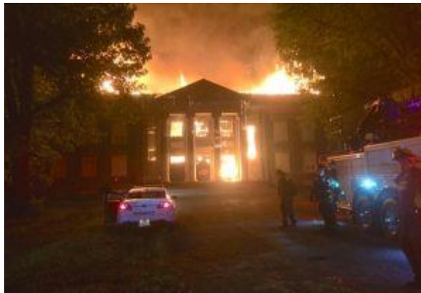
Memorial Hall September 21, 2014

Oh, better that her shattered hulk Should fall beneath the flames. Her students sailed the mighty deep; Remember well their names.